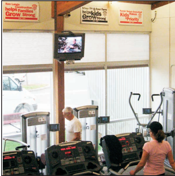
Deer Path Branch in Flemington

Don't miss your chance to have a banner with your business name displayed at the two branches of the Hunterdon County YMCA!