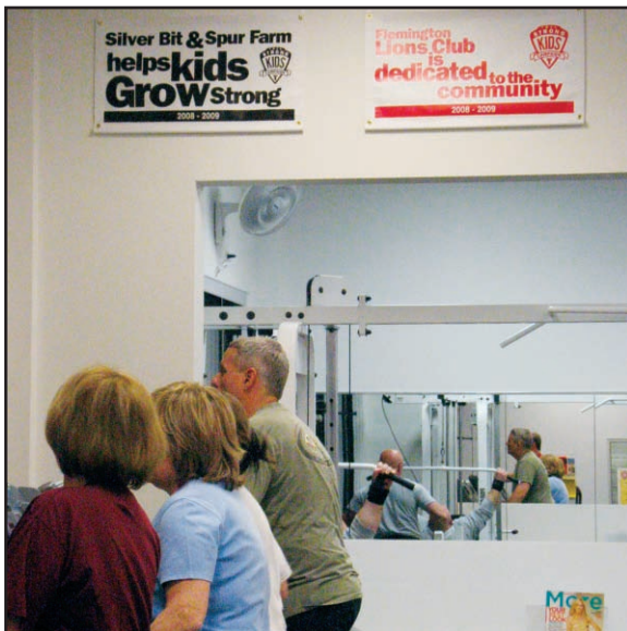
Round Valley Branch in Annandale

Hunterdon County YMCA 144 West Woodschurch Rd. Flemington, NJ 08822